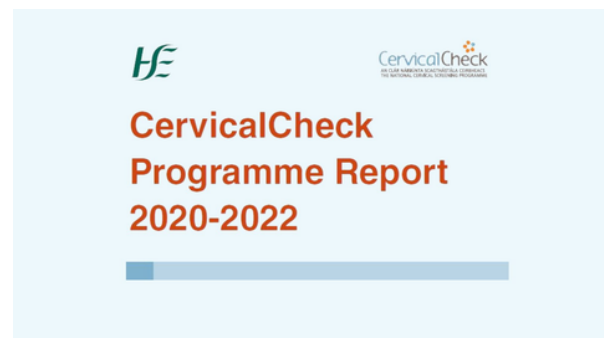
CervicalCheck programme 2020-2022

“This report tells the story of the first 2 years of primary HPV cervical screening and of the women who chose screening amid all the pressures brought by a global pandemic. It details the continued work done by all our screening partners, the dedicated CervicalCheck staff and National Screening Service teams, each making a valuable contribution to improving the health of our nation. I look forward to working collaboratively to achieve Ireland’s commitment to the World Health Organization’s cervical cancer elimination goal to make cervical cancer rare in Ireland by 2040.”