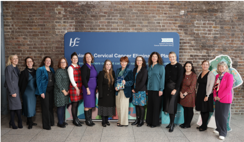
Members of the Strategic and Delivery Groups to eliminate cervical cancer in Ireland .