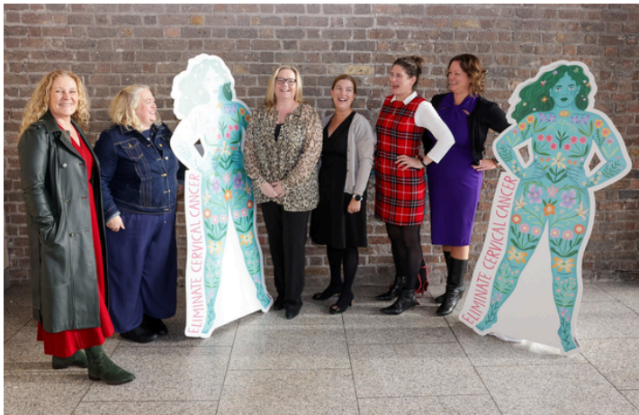
Colposcopists, ANP and members of the CervicalCheck team attending the launch of the Cervical Cancer Elimination Action Plan.